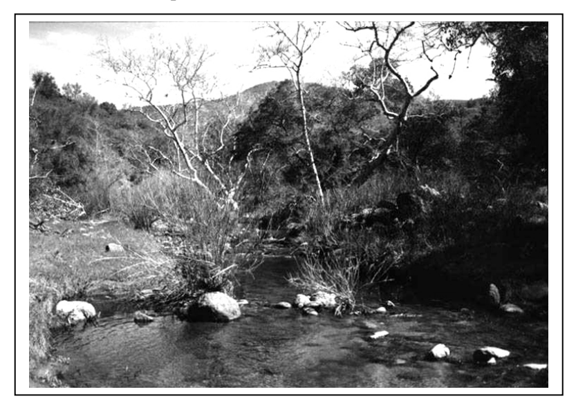
Boulder Creek on May 4, 2004, six months after October 2003 Cedar Fire