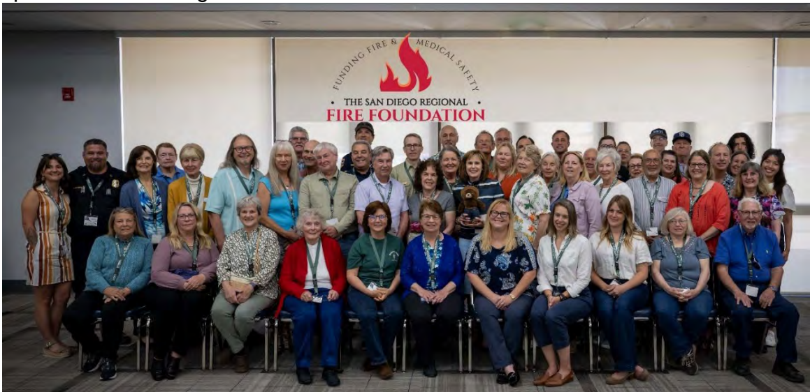
Image 4. The 17 th Annual Fire Safe Council Awards ceremony in May 2024.

Also, the Conservancy has provided the SDRFF $392,405 to support 13 Fire Safe Councils (FSCs) in San Diego County. The FSC community volunteers contributed over 14,000 hours to chip and remove 900,000 cubic feet of vegetation and conducted community educational sessions attended by 8,000 individuals to learn how to make their properties fire-safe and create evacuation plans and determine escape routes. Below is an image of San Diego County Fire Safe Council representatives and grant funders.