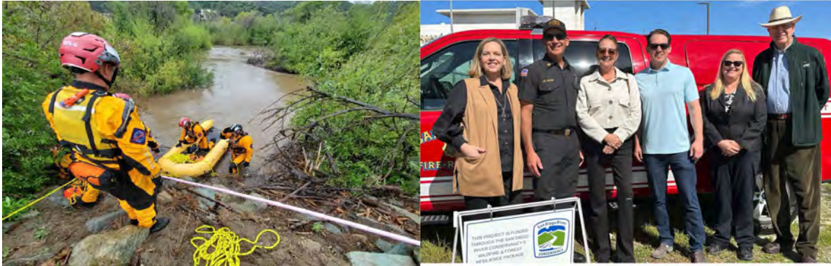
Image 5 and 6. The City of San Diego’s River Rescue Team (left) wearing new dry suits in San Diego River. Members of the City of San Diego Fire-Rescue, San Diego Fire-Rescue Foundation and the San Diego River Conservancy (right).

The San Diego Lifeguard Service established its river rescue team in 1978 to respond to emergencies created by flooding due to heavy rain. The task of the team is to rescue people or property surrounded by water. Image 5 shows the river rescue team in action. In addition to their local responsibilities, the team is assigned to the Urban Search and Rescue Task Force. For a video by CBS News 8, click here: “San Diego River Rescue team gets new dry suits.”