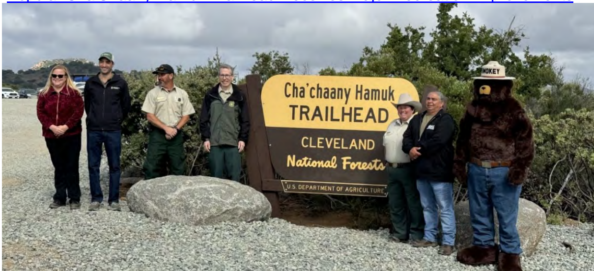
Image 3. In May 2024, the Conservancy attended the renaming of the Three Sisters Falls Trailhead to Cha'channy Hamuk in the Cleveland National Forest through a partnership with the National Forest Foundation and the Wildlife Conservation Board.

The Governing Board of the Conservancy has approved 19 projects totaling over $19.4 million to help reduce the risk and intensity of wildfires in the County of San Diego. This program supports wildfire and climate resiliency. For Fiscal Year 2023, the Conservancy's funds were used to treat 2,203 acres, provide defensible space for 286 homes, and support for 10 fire districts/departments, 35 fire stations and 13 Fire Safe Councils. A grant from the Conservancy funded a new helicopter landing zone, parking for emergency vehicles and three 10,000-gallon underground water storage tanks. The image below depicts the trailhead where facilities were upgraded to improve safety during wildland fires and other emergencies. For a video by the National Forest Foundation, click here: "Popular Cha'Chaany Hamuk Trailhead Receives Major Recreation Improvements."