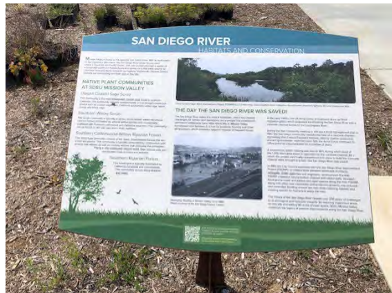
Images 1 and 2. Prefabricated gender-neutral restrooms (left) and one interpretive panel (right) installed throughout San Diego State University's River Park at Mission Valley.